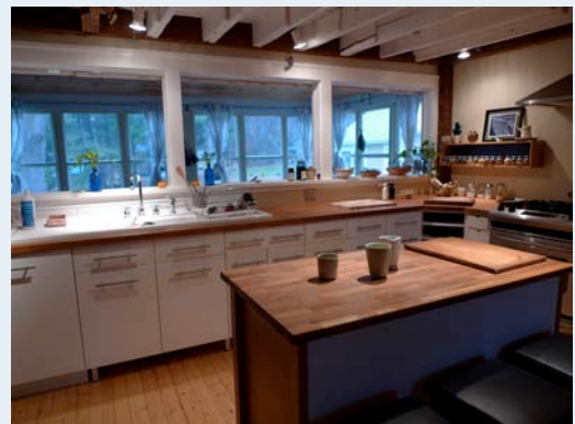
The Main House kitchen